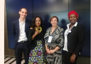
Five days of collaboration, networking and sharing knowledge Africa Centre for Evidence and Africa Evidence Network colleagues attending the conference

The Board of the African Evaluation Association (AfrEA) worked in partnership with the Réseau Ivoirien de Suivi et d'Evaluation (RISE), African Development Bank and the Government of Ivory Coast to organise the 9th AfrEA International Conference, held in Abidjan, Cote D'Ivoire from 11 - 15 March. The aim of the conference was to encourage and support AfrEA's "Made in Africa" approach. This year's theme was " Accelerating Africa's Development: Strengthening National Evaluation Ecosystems ". Some colleagues from the Africa Centre for Evidence and Africa Evidence Network senior teams participated at this conference, which allowed them to share knowledge, network and collaborate with many global institutions and individuals.