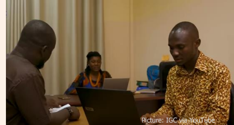
Working to avoid waste Research team in Ghana involved in the IGC research project featured in the mini documentary.

Local government decision-makers in Ghana have implemented a policy which dictates that only districts that complete infrastructure projects (such as school or hospital buildings) will receive future funding. Featured in a mini documentary published by the International Growth Centre (IGC), the policy implementation is informed by an investigation into the discrepancy in infrastructure project completion between various districts. The evidence indicated that districts would lobby for new infrastructure projects to be started before other projects had been completed, resulting in not only a low project completion rate overall but also wasted expenditure.