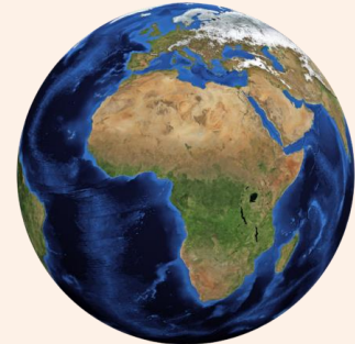
African Scientists Directory The directory promotes and facilitates capacity-building in Africa.

Calling all African scientists to register on the African Scientists Directory . Join this network of scientists to collaborate, build trust, increase impact, and connect! The directory is a joint effort by the International Science Council Regional Office for Africa and the Academy of Science of South Africa , financed by the South African Department of Science and Innovation . It offers pertinent knowledge on African specialists in humanities, mathematics, engineering, natural, and social sciences. The directory aims to enable the free movement of experts and scientific information on the continent, accumulate and distribute important scientific information for Africa, as well as promote postgraduate training initiatives for early-career scientists, amongst others.